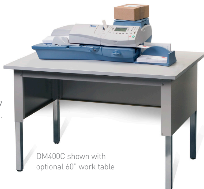
DM400C shown with optional 60" work table

The flexible, fully automatic DM400C Digital Mailing System adds value to mail every step of the way. Customize performance to your needs, and benefit from the broad range of Pitney Bowes advantages including Commercial Base Pricing, Total Postage Management and 24/7 connectivity to money-saving USPS services and critical business insight. Design your ideal mailroom—today—with Pitney Bowes.